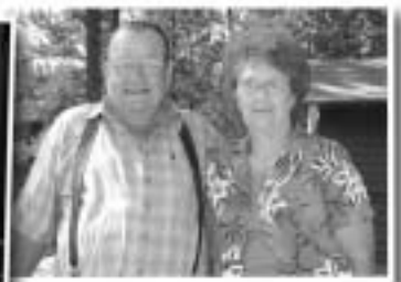
Senior Adults Retreat at Camp Judson