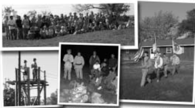
Royal Rangers - Pow Wow 2004

POSTMASTER Send address changes to: SD UPDATE PO Box 91750 Sioux Falls, SD 57109