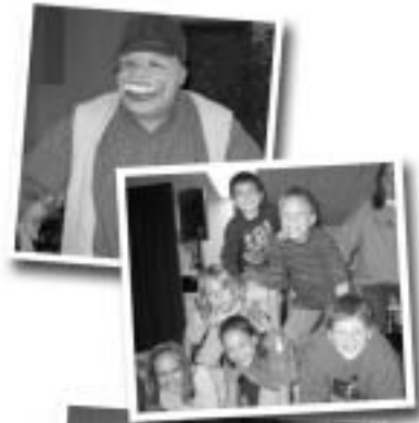
Great faces at "The Buzz" in October.