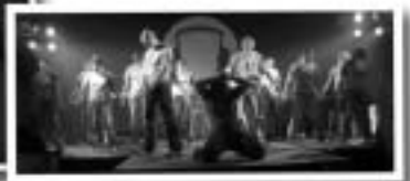
Amplified Youth Convention