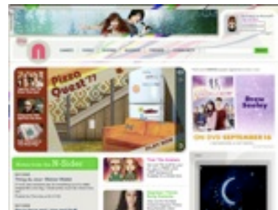
the-n.com (nighttime tv network for teens)